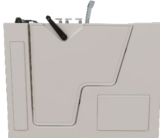
Door Closed Door Handle Locked Position