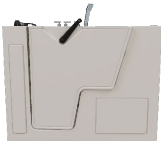
Door Handle Unlocked Position