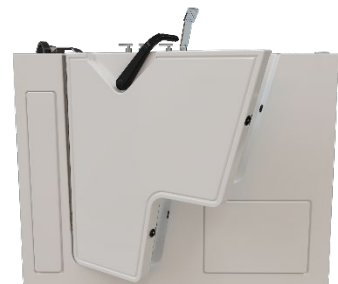
Door Left Open Maintains seal life when not in use.